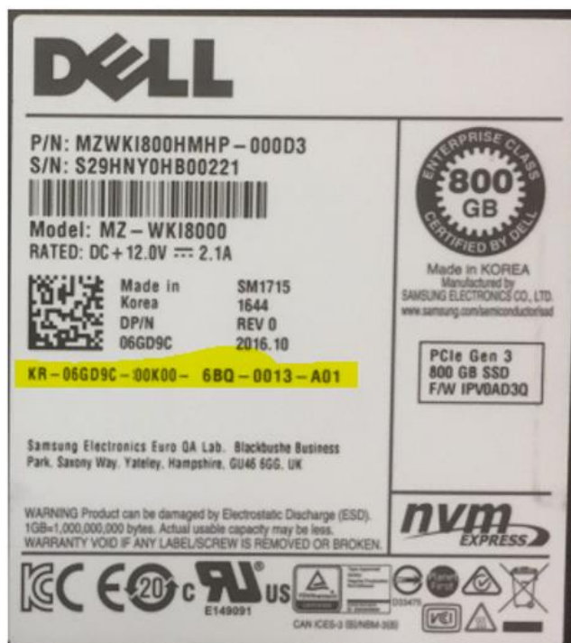
Figure 2. Hard drive label with PPID highlighted